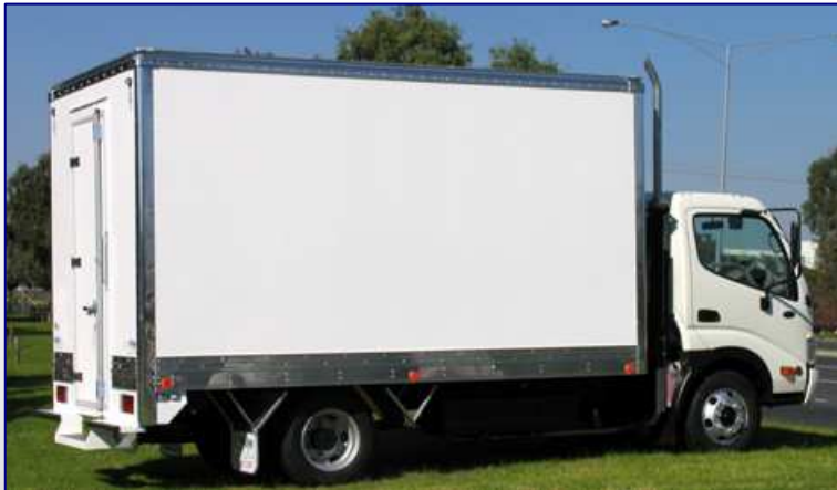
Peki Fleet Solutions Body