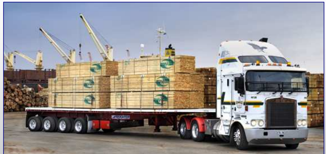
Freighter Semi-trailer made by MaxiTRANS New Zealand